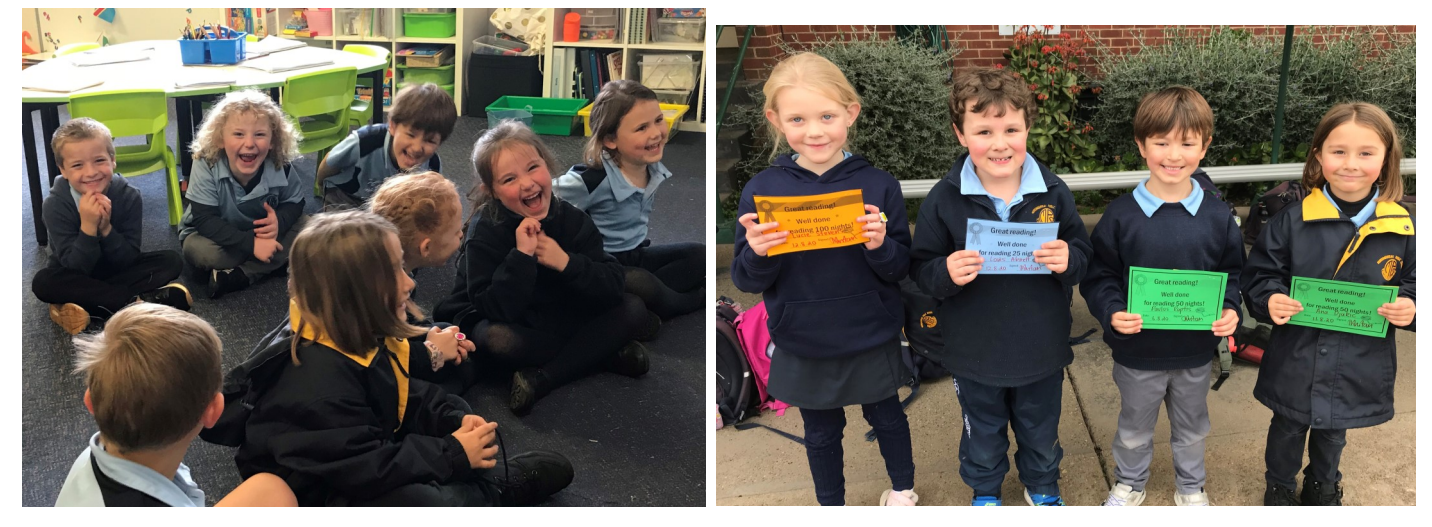
Above: Something funny happening in K1/D and reading award recipients.