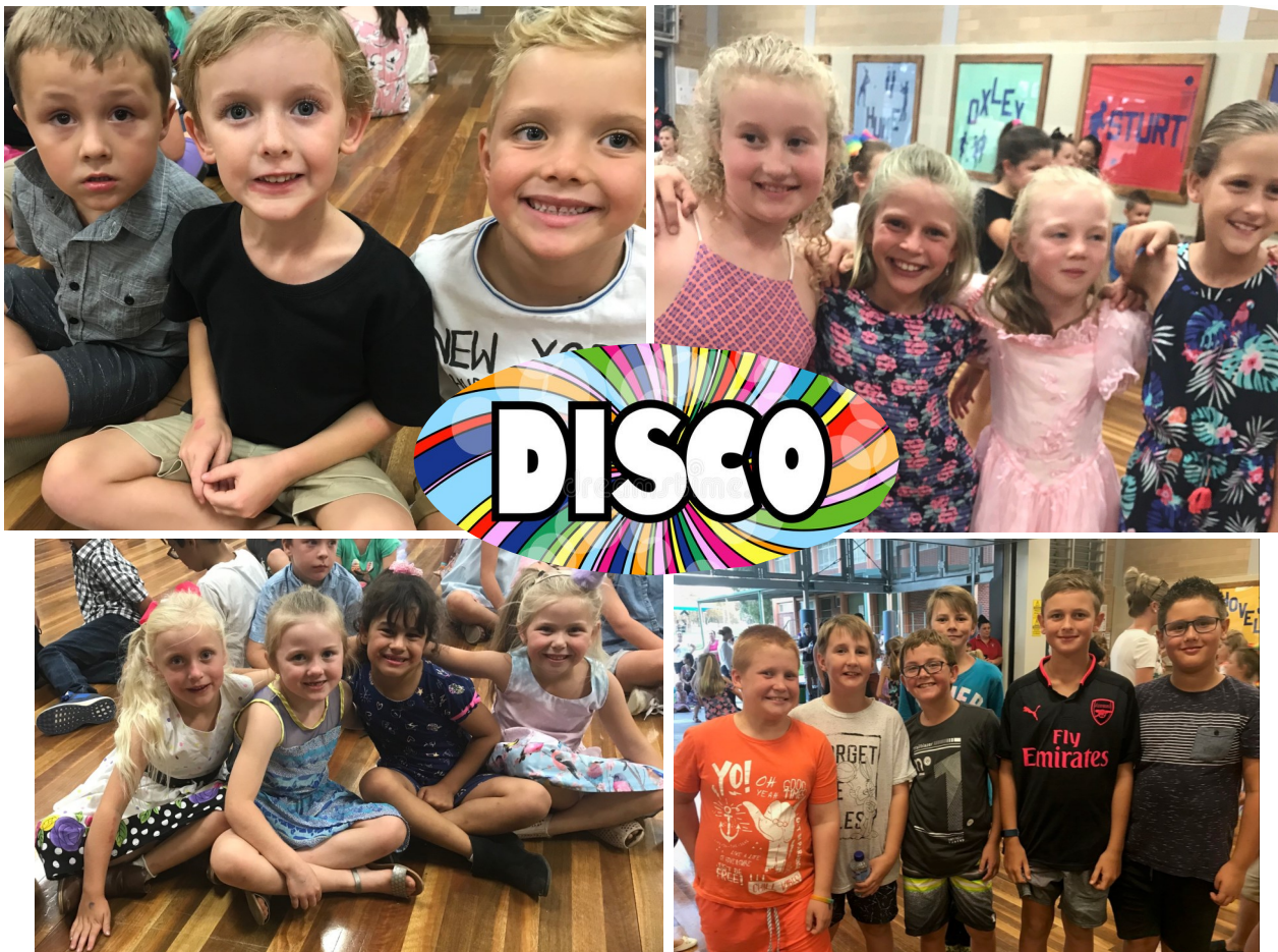
A great time was had by all at the disco hosted by the SRC at the end of term one. As well as the fun, the SRC raised just over $400.