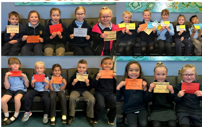
Beaming smiles from all our home reader award recipients this week!