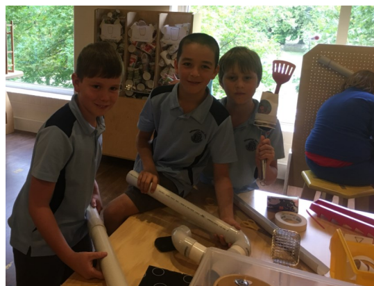
Year 4 students experimenting at Questacon!