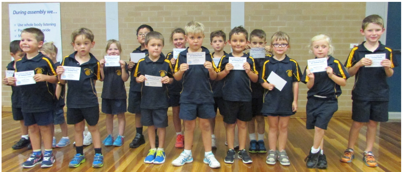
Well done Kindergarten students on completing your first Swimming Carnival