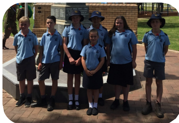
Remembrance Day Service