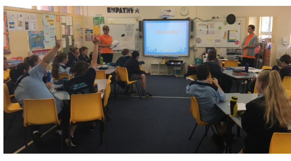
Future Moves representatives talking to our Year 6 students last week