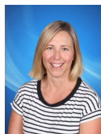
Nicole Ward Library/ Music