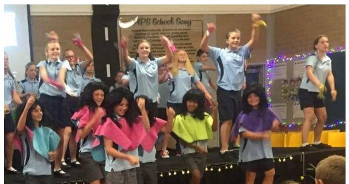
Year 5 and 6 entertained at Presentation Night with their performance from 'Hairspray'