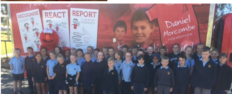
Above: Captains from both Trinity Primary School and MPS receiving a gift for each school from the Daniel Morcombe Foundation