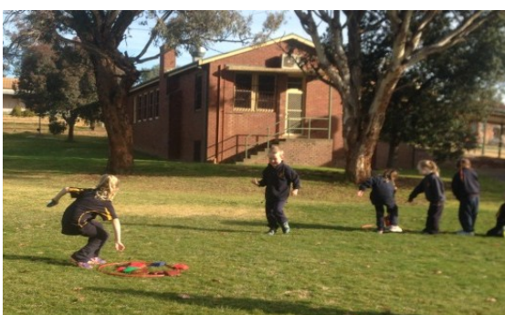
Kindergarten students enjoying the moving game 'Rob the Nest' focussing on running, throwing and dodging.