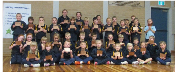
Well done to students who represented MPS at the town ANZAC service.