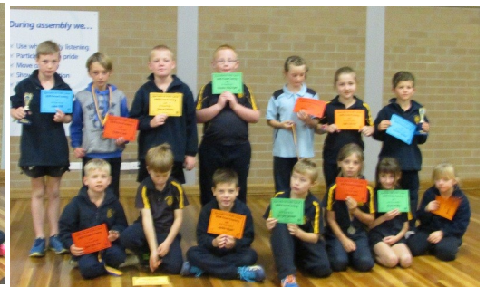
Congratulations to all our cross country placegetters pictured above who received their certificates at Friday's assembly.