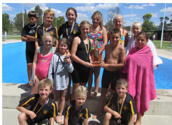
Some of our swimmers with the Cootamundra PSSA Champions trophy