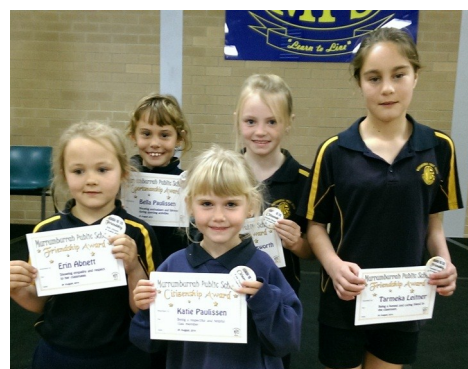
Well done Student Leadership Award recipients