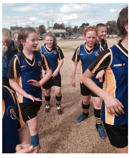
The girls after their soccer win!