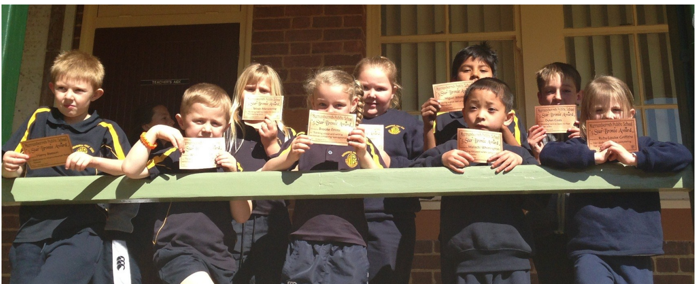
Class Award Recipients