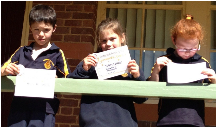
Student Leadership Awards