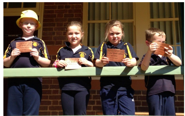
5 Star Bronze Awards